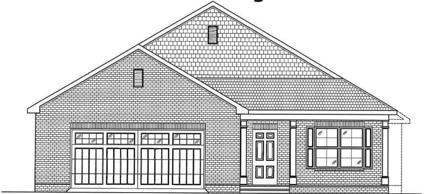
FRONT ELEVATION - A